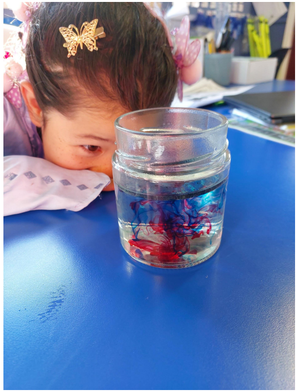
Science in action. Fireworks in a jar.